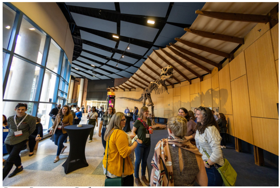
Gaston County, 2023 Conference