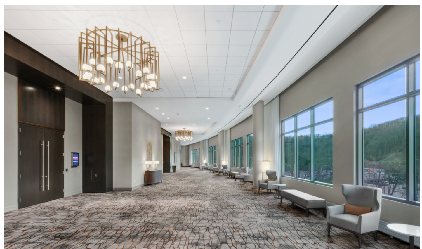
Exhibitor's Hall area, courtesy of Harrah's Cherokee Casino Resort

To encourage attendees to visit and talk with all exhibitors, we are providing several fun activities throughout the conference!